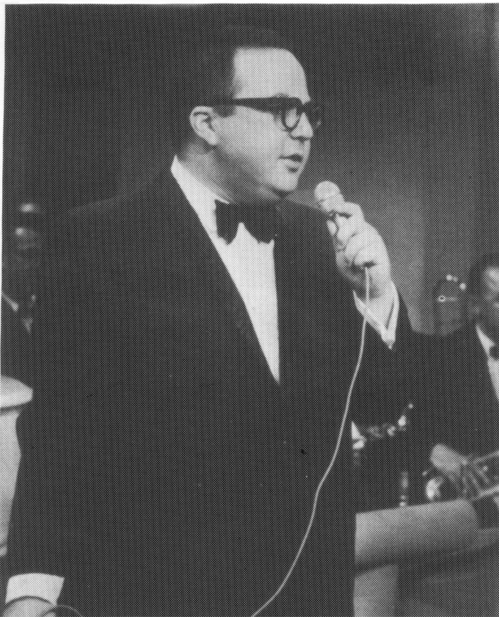
Debbie Reynolds) on the 1963 LP of Guys And Dolls (Reprise 2016)

the following discs feature reissues of the above vocals: